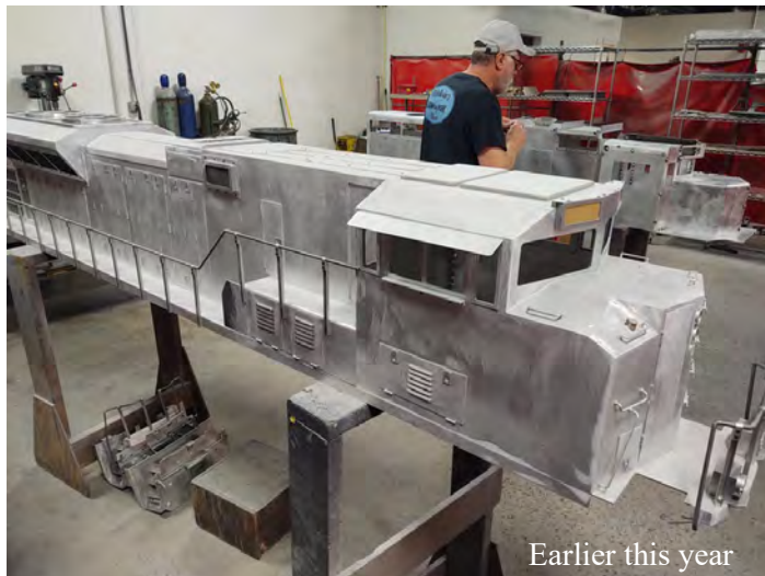
Earlier this year